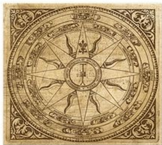
Compass Rose – Catalan Atlas – c 1375

In case you were wondering: 94 Days to Sailing Season! But who's counting?